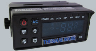
Digital In-cab control box with Auto Start function