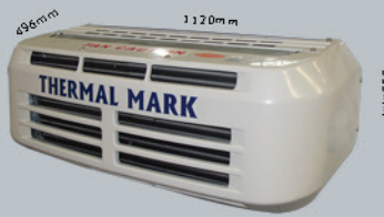
TM-500 II Condenser Unit Approx. weight 37kg

TM-500 Series Quality you can count on to get the job done!