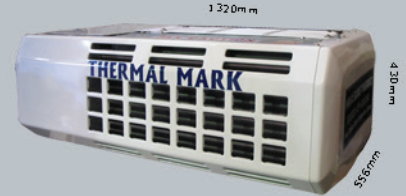
TM-500 ESC Condenser Unit Approx. weight 133kg Available in 415v or 240v