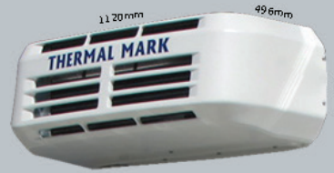
TM-250 II Condenser Unit Approx. weight 32g