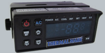
Digital In-cab control box with Auto Start function