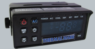
Digital In-cab control box with Auto Start function