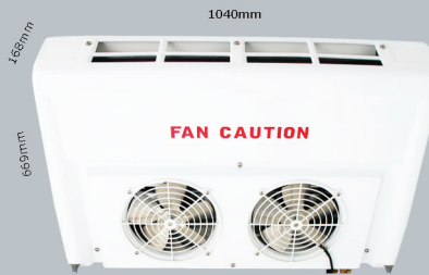
Slimline Evaporator 12v or 24v Approx. weight 24kg