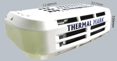
TM-100 ESC Condenser Unit Approx. weight 115kg Available in 415v or 240v