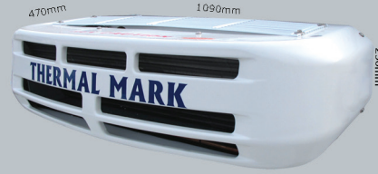
TM-100 II Condenser Unit Approx. weight 25kg

Quality you can count on to get the job done!