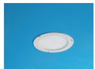
Internal recessed lights